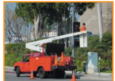
A worker installs a red LED traffic lamp at an intersection in Redlands, California.

Equally important is their longevity. When stoplights burn out, replacing them is inconvenient at best, and the loss of traffic control can be dangerous. LED traffic lights can last as long as ten years, compared to roughly two years for their conventional counterparts. Those advantages make LEDs well suited for other hard-to-access applications, including highway signs and water buoys.